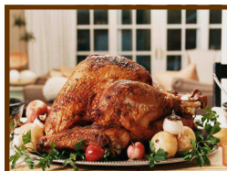
Day After Thanksgiving Party

We want to have a "debrief session" and strategize on Sunday, November 1 immediately after worship time. Lunch & childcare provided!